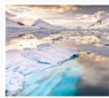
Antarctica is far away from the equator and has a cold climate.

Weather and climate mean different things. Weather is rain, sun or snow and it is changing all the time. Climate is the pattern of weather over a longer time. There are differences in the climate between continents across the world.