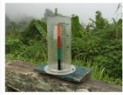
A rain gauge is used to measure the amount of rainfall.