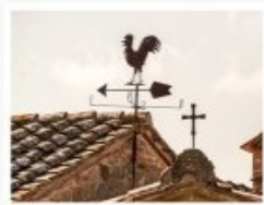
A weather vane is used to show the wind direction.