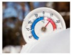
A thermometer is used to measure the temperature.

Weather can be measured using simple equipment.