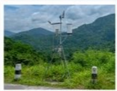
An anemometer is used to measure wind speed.