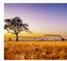
Africa is close to the equator and has a hot climate.