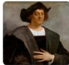
Christopher Columbus was the first European person to discover the Americas.