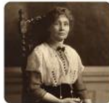
Emmeline Pankhurst stood up for women's rights.

A year is 365 days. A decade is 10 years. A century is 100 years.