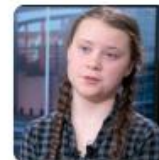
Greta Thunberg campaigns to stop climate change.