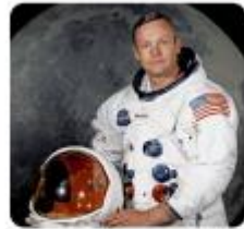
Neil Armstrong was the first person to walk on the Moon.