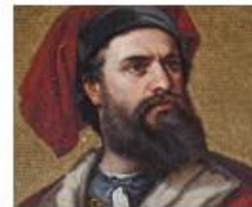
Marco Polo explored Asia