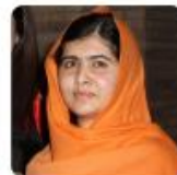
Malala Yousafzai campaigns for girls to have the right to go to school.