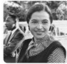
Rosa Parks wanted black people to have the same rights as white people.