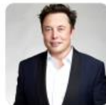
Elon Musk is trying to make a rocket to go to Mars.

A year is 365 days. A decade is 10 years. A century is 100 years.